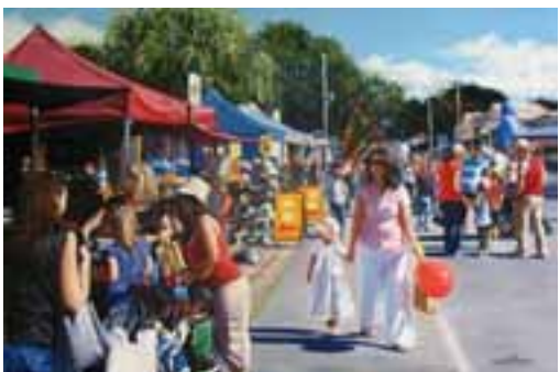
Top left: 'Don't go'. Above: Off to the Beach. Below Left: Dayboro Day Colours. Below Right: Looking for Critters.

For as long as I can remember, I have always loved art... I often get asked 'what inspires me?' When I was growing up...we made our own fun. We didn't go on expensive holidays or theme parks, our holidays were spent camping or we would rent an old 'beach' house and play on the muddy tidal flats, pumping yabbies for fishing. As a family we would go for Sunday drives....we might go for a bush walk, search under logs for 'critters', picnic in the middle of 'no where', or go for a cool swim in a rock pool in the mountains. When I first started painting, I mainly painted the beautiful places that my husband and I travelled to on our many camping journeys. Now that I have my 2 beautiful girls...I am sharing the beauty of the outdoors with them, and they now feature quite often in my artwork. I have been told by many people, that my artwork brings back childhood memories for them, and I hope that my artwork reminds you of a special memory too.