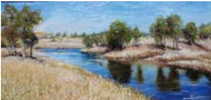
Left: Stanley River, Somerset and, Right: The People's choice winner from 2006, 'Follow me and watch your step'